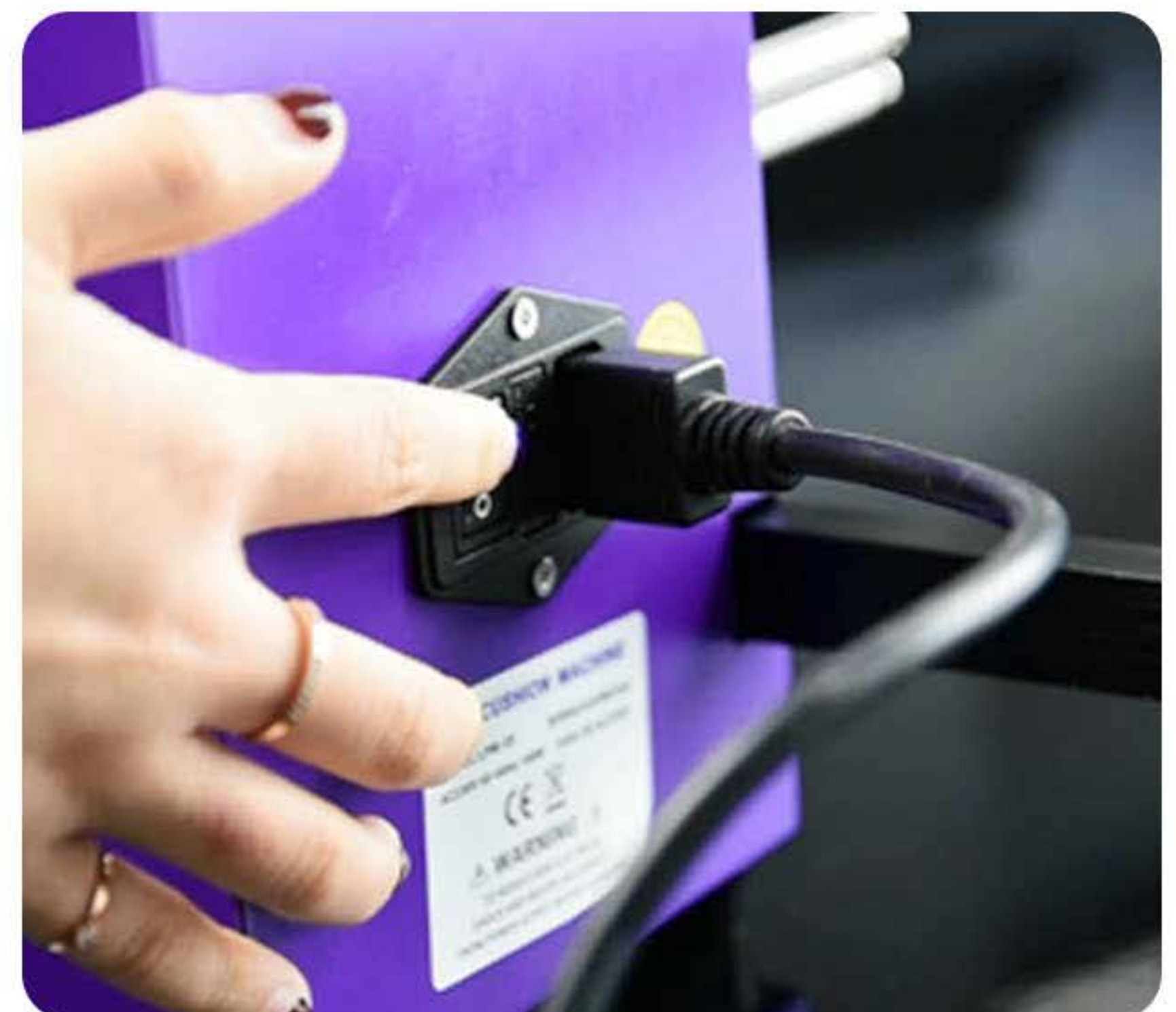
Insert power, turn on the switch