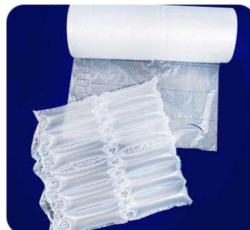
Air Column 3/5 row